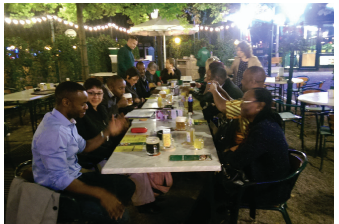
The African Cochrane contributor's dinner organised by Cochrane SA