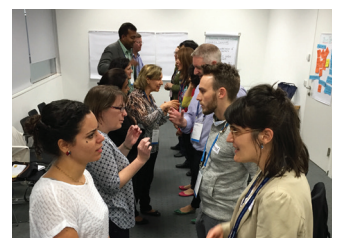
Getting to know you - the facilitation workshop run by Cochrane SA

Those of us who needed some adrenaline also went for a swing at a height of 90 metres! It was amazing to see Vienna from a bird's eye view at night!