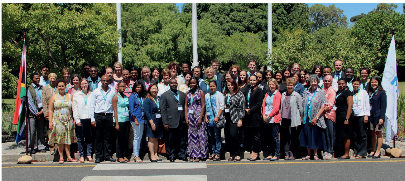
The summit participants at the SAMRC, February 2016

The SAGE Project is funded by the South African Medical Research Council in terms of the SAMRC's Flagships Awards Project SAMRC-RFA-IFSP-01-2013/ SAGE.