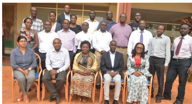
Course participants at the training venue

Kampala, the city of seven hills, is the capital of the 'Pearl of Africa' as Sir Winston Churchill observed during his Ugandan exploration. It is here that Makerere University, once known as the 'Harvard of Africa', hosts the Africa Centre for Systematic Reviews and Knowledge Translation. Together with colleagues from Cochrane South Africa, we held the first GRADE workshop in Uganda, three years after the founding of the Africa Centre. Our core mandate is to strengthen capacity for evidence synthesis and use, largely in the East African community through innovation, collaboration and open access.