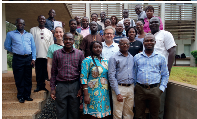
Primer participants in Ghana

was included at the start and end of each day; to assist participants in clarifying objectives, to find out whether set objectives were met, and to give participants time for feedback and questions.