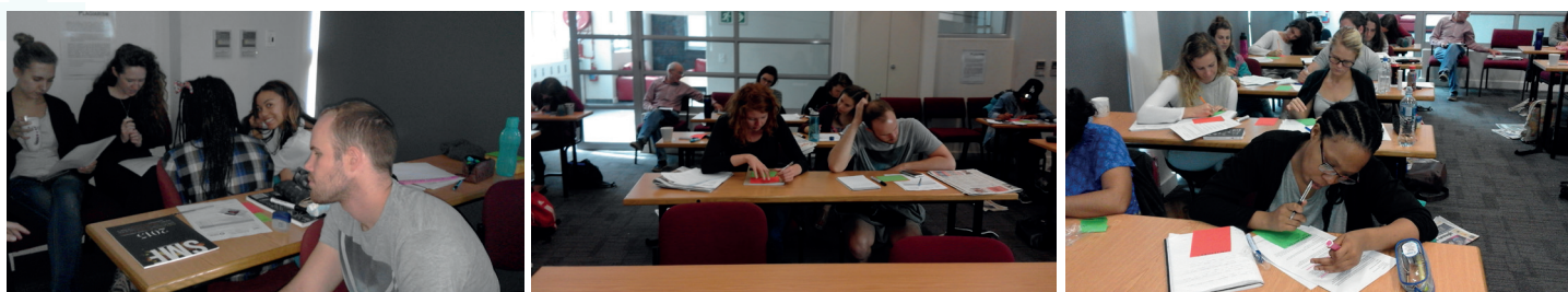
Getting to grips with systematic reviews and working on potential stories